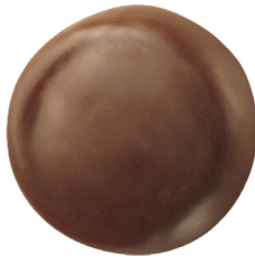
Peanut Butter Patties®

All varieties of Girl Scout Cookies (except gluten-free) are sold at $5 a package. Visit www.abcbakers.com to learn more