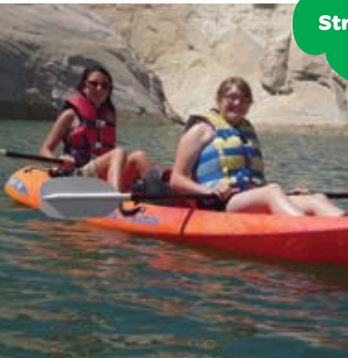
This past June, Troop 781 took an eight-day trip to the Grand Canyon. The girls went hiking, camping, kayaking and even got to travel by Jeep and mule!

Expansion of First Lego League and First Robotics programs continued and encompassed Waco and Belton this year with two first year teams qualifying for regional competition.